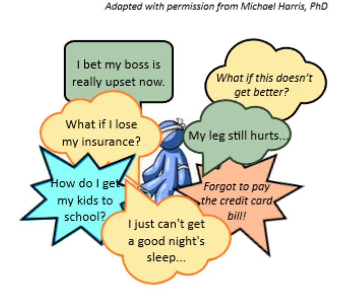
Worker's Perspective of Injury

Biopsychosocioeconomic (BPSE) aspects involved in a work injury reflect the biological, psychological, and socio-economic factors that may facilitate or impede recovery. BPSE factors contribute to potential barriers, as well as concurrent mental health (MH) conditions (e.g., anxiety or depression). When combined with a debilitating injury, BPSE factors may become more significant and influence recovery, and at that point, they must be addressed.