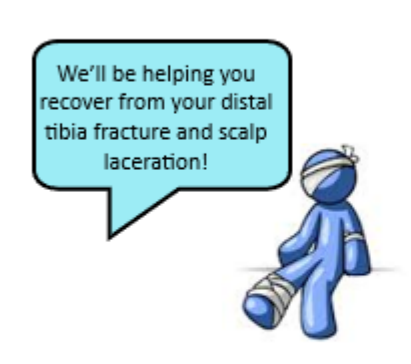
Workers' Compensation Perspective of Injury

Everyone experiences stress and has life challenges to cope with. A 1999 Surgeon General's report estimated that only 17% of the US population is in a state of "optimum" mental health.<sup>3</sup> The likelihood is high that some workers' psychosocial states may warrant attention during recovery, based on their individual situation and coping skills.